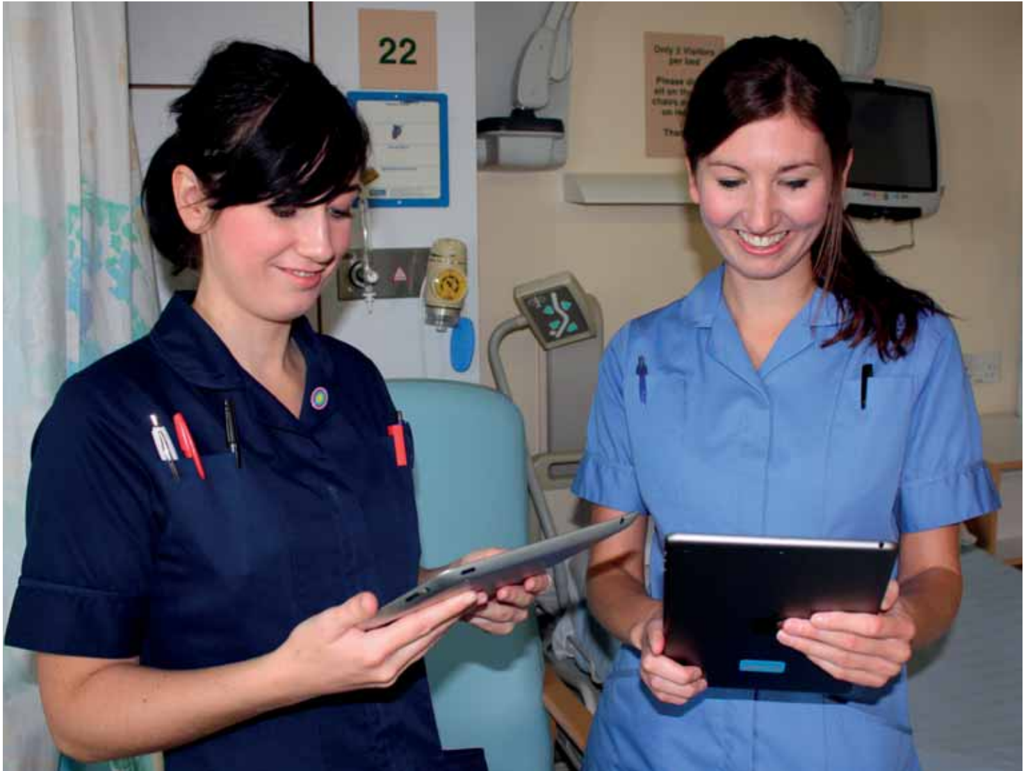
Nursing staff demonstrate how to use the free Wi-Fi